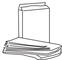
Cardboard & paper